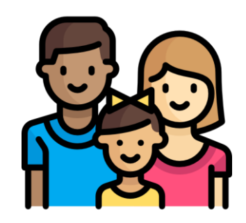
Reaches all families, regardless of barriers

Welcome Baby engages community members and families from all walks of life, creating relationships with EPL for the long term